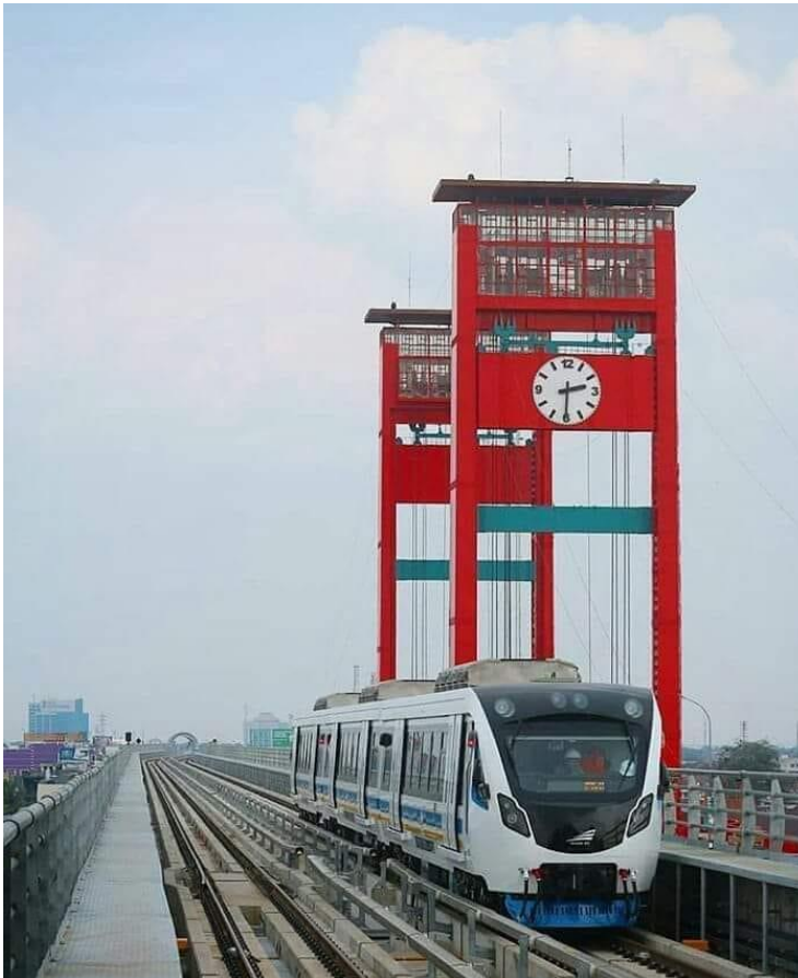
Asian Games XVIII Palembang, Jembatan Ampera Project: Kementerian PUPR, 2 Agustus 2018