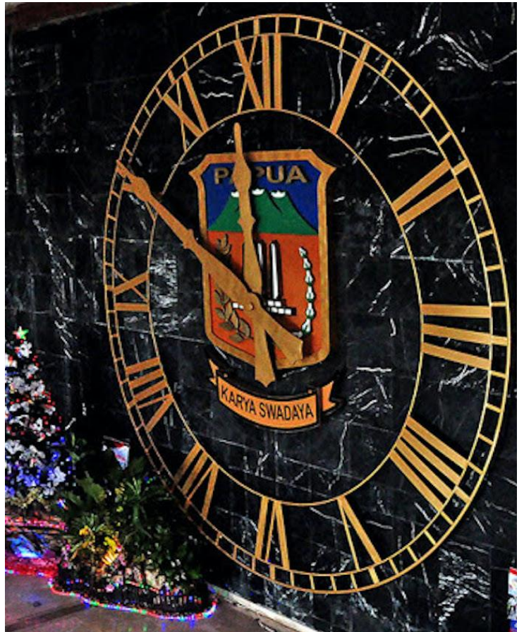
Jam Besar diameter 650CM di loby kantor Gubernur Papua di Jayapura dibangun pada tahun 2014