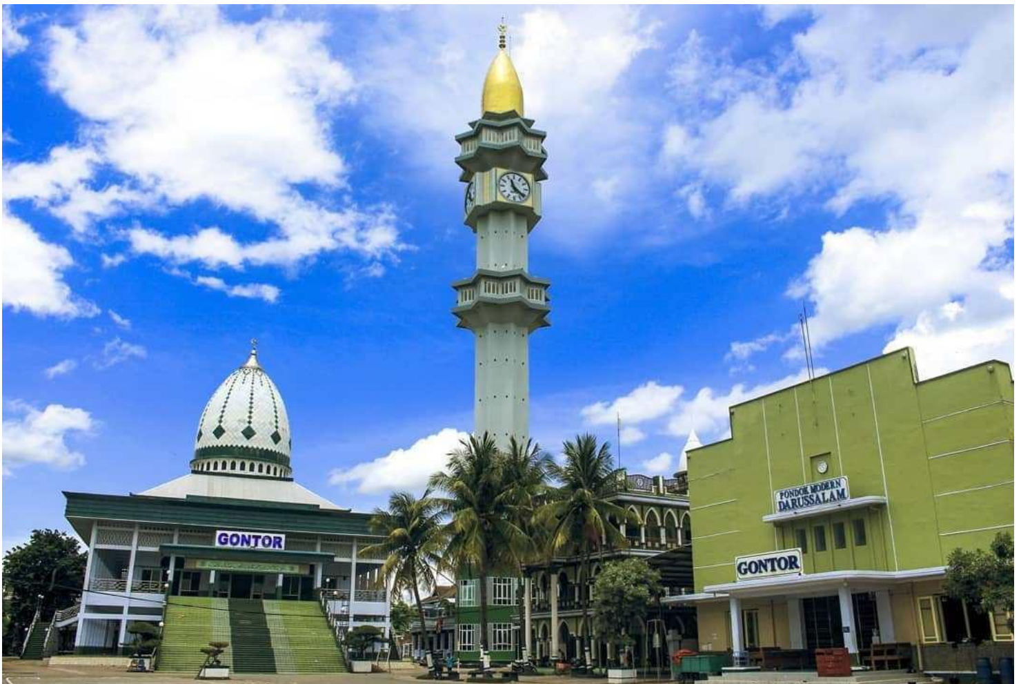
Menara Masjid Jami Gontor dibangun dengan ketinggian 85 meter, dilengkapi dengan 4 jam analog ukuran besar dengan diameter jam 4 meter di empat sisi arah mata angin.

Peletakan batu pertama dilaksanakan pada tahun 2016 oleh Bapak Presiden RI dan Pimpinan Pondok, peresmian dilakukan oleh Bapak Jusuf Kala, tahun 2018